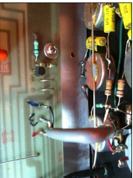
WIRES FROM TONE CONTROLS