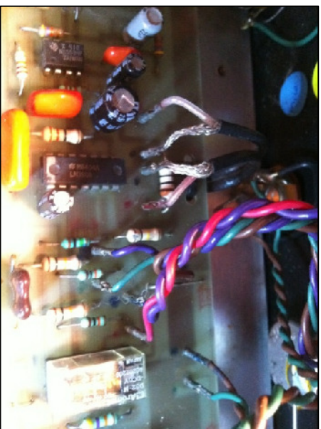
WIRES NEAR REVERB CONTROLS