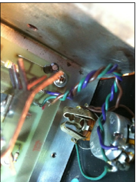
WIRES AT VARIABLE WATTAGE CONTROL