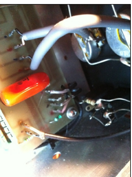
WIRES AT INPUT JACK